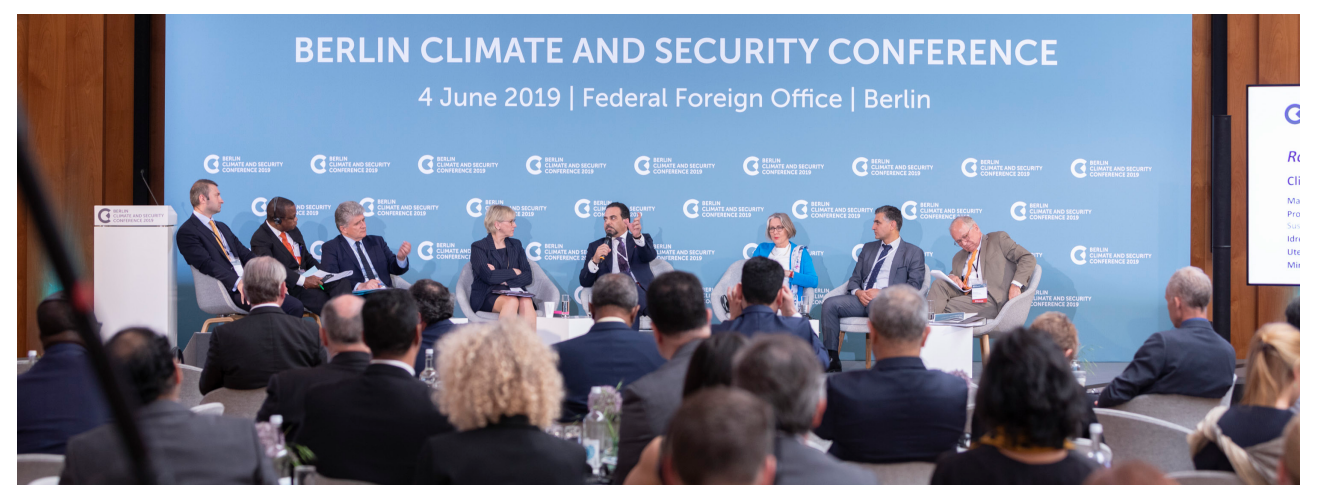
Panel discussion on climate change impacts and state fragility.

Panellists proposed several areas for action including reducing the costs of disasters; securing resilient ecosystems and sustainable value chains; and integrating climate resilience into all investment decisions. Governments would need to start thinking and planning long-term in order to achieve these objectives. These efforts should be complemented with foresight exercises and similar initiatives to analyse and respond to complex interconnected phenomena. More collaboration with civil society organisations and, critically, the private sector, could also help to design and implement targeted and context-specific solutions to climate-related challenges that focused on job creation, technological innovation, and better systems and institutions for natural resource management. They also suggested that the insurance industry could play a key role by introducing more predictive approaches and new financial instruments to manage climate risks.