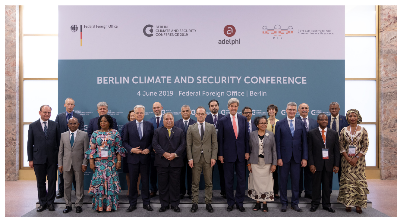
Ministers and experts who attended the BCSC.

The conference underscored that, in the interests of global security and stability, all countries needed to step up their efforts in the area of climate protection. However, as long as the international community's climate goals are insufficient to limit global warming to a safe level, there is also a clear and urgent need to address the foreign and security policy impacts of climate change. To this end, the Berlin Call to Action provides three concrete steps to consolidate efforts and move forward.