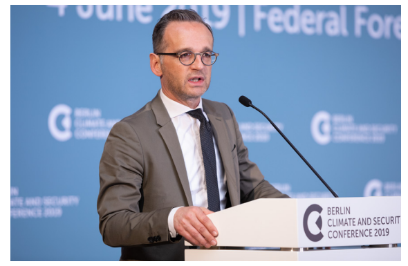
Heiko Maas giving his keynote address at the BCSC.

Pointing out concrete activities through which the German Foreign Office was supporting each element, he called on conference participants to support the Berlin Call for Action and invited the audience to a foreign ministers' meeting to be held in the context of the UN Climate Action Summit in September 2019 to discuss how to further flesh out this agenda.