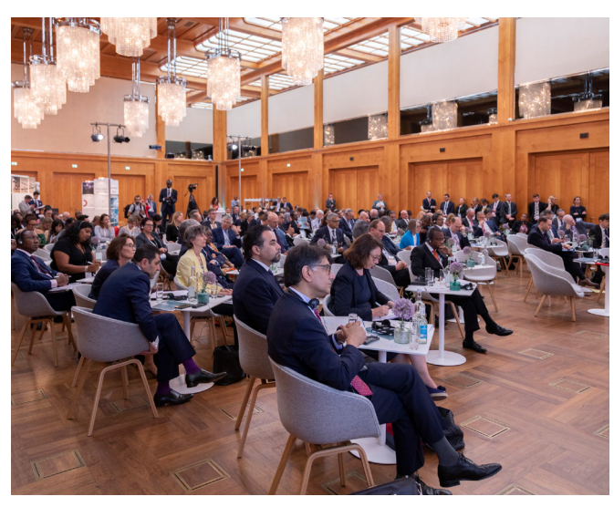
The Berlin Climate and Security Conference.

To help generate the necessary political momentum and develop concrete, scientifically substantiated recommendations for action, the German Federal Foreign Office, together with the Potsdam Institute for Climate Impact Research (PIK) and adelphi, organised the BCSC. The conference took place in Berlin on 4 June 2019. It brought together some 250 participants, including numerous foreign ministers and many high-ranking officials from around the world as well as numerous experts from international organisations, academia and civil society.