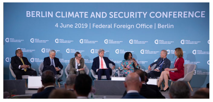
Panel discussion on political responses to the threats climate change poses for international peace.

Finally, panellists stressed the need to include those worst affected by climate change in the debate on the climate-security nexus. They encouraged world leaders to develop a shared and ambitious vision by including women, children and other marginalised groups in the conversation, pointing to the critical role youth had to play in informing political action as they would be the ones most strongly affected by rapid and irreversible climatic changes.